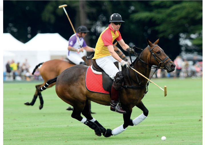
▲ Prince William, Jerudong Park trophy, 2017.