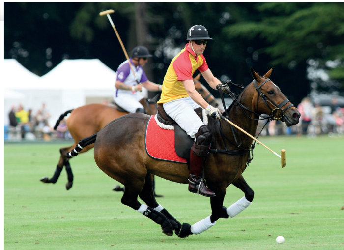
▲ Prince William, Jerudong Park trophy, 2017.